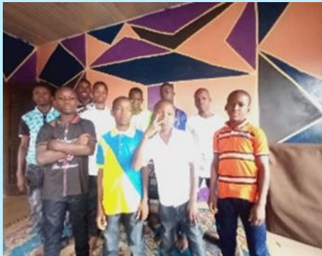
Celebrating Eid el Kabir in July

HOLIDAY ACTIVITIES: The boys spent the summer holidays participating in a variety of activities – learning and recreational.