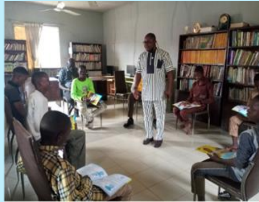
Talks on skills development given to the boys by members of the Lions Club, Ipakodo