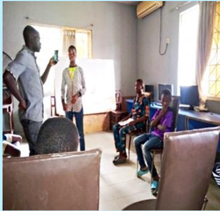
Public speaking and debating competitions