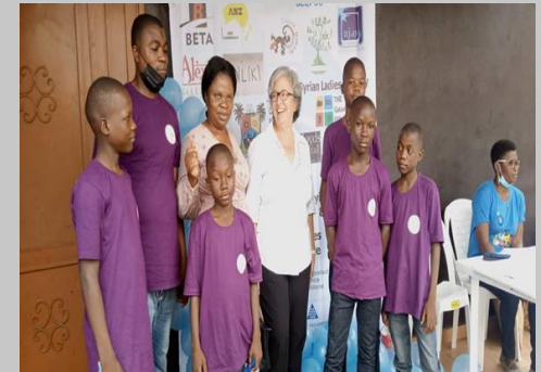
Above: CLL children and staff with another guest at the event

SPECIAL INVITATION: Street Child Care Welfare Initiative, an NGO and fellow member of the Consortium for Street Children, invited CLL to a spelling bee as part of their “Kids do Spell” project, targeted at primary school pupils in Lagos State.