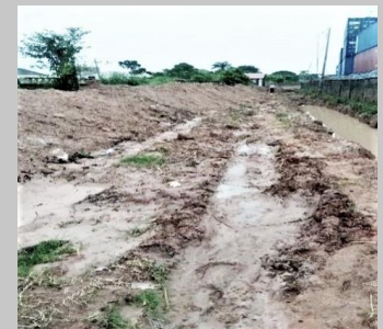
Welfare Road, leading to CLL Ibeshe Home