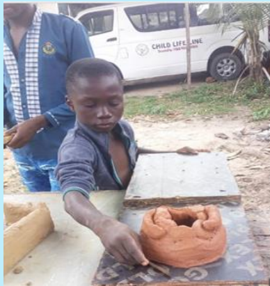
Modelling with clay