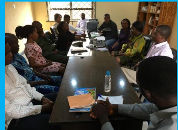
CLL staff meeting