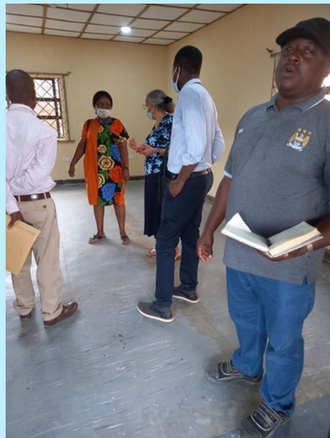
Above: inspecting the renovations; Far left: the view from the road; Left: the entrance to the building