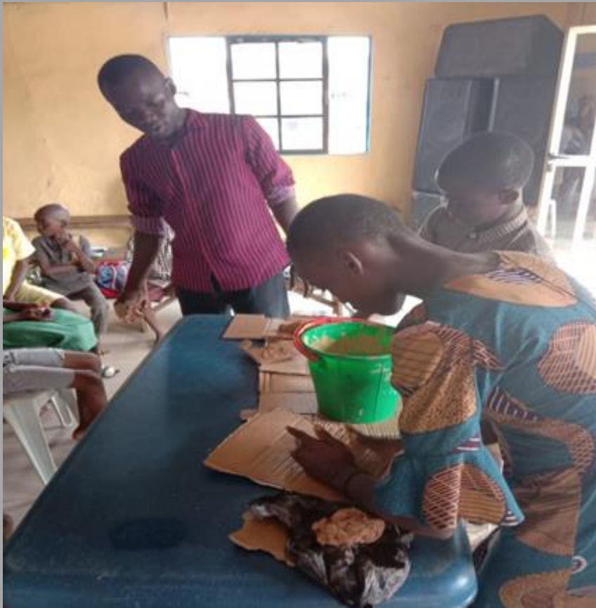
A clay modelling class

All the children in the project are now attending school daily and are working hard to catch up on lost learning. CLL staff follow up with their teachers to monitor progress.