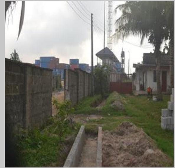
Drainage construction under way