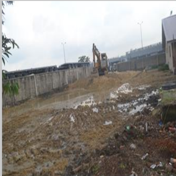
Filling in the land after draining most of the water